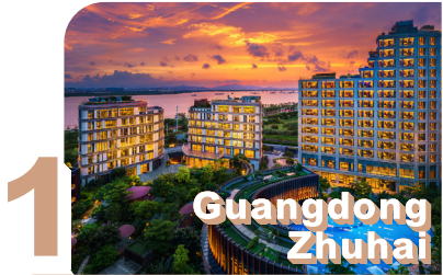
Serensia Woods Hotel

Large scale wellness resort with five-star healing experience