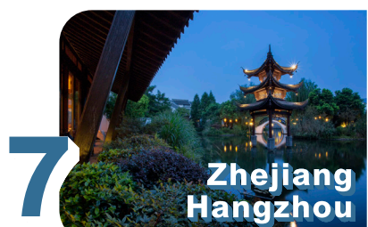
Banyan Tree Hangzhou

Modern interpretation on oriental elegance