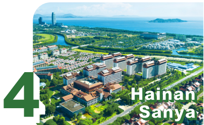
Haitang Bay Health Valley Resort

Living by the sea with beautiful environment