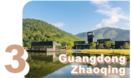
White Swan Resort Green Bay

24-hour featured concierge service and to enjoy natural radon hot springs