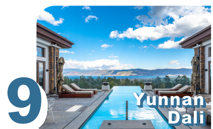
Honor Resort Yun Shu

Surrounded by green mountains, perfect place for retreat