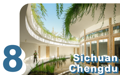
Six Senses Qing Cheng Mountain

Modern interpretation on oriental elegance