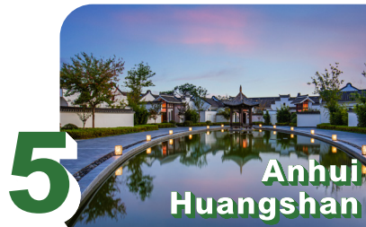
Banyan Tree Huangshan

Living by the sea with beautiful environment