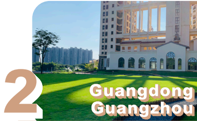
Conghua Sunny Home

Large scale wellness resort with five-star healing experience